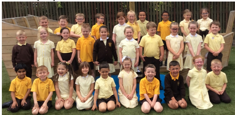
Our Year 1 children...