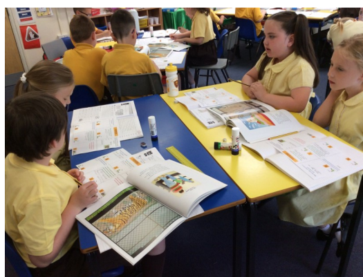
Year 3 answered reading VIPERS comprehension questions about their class book Zoo by Anthony Browne.