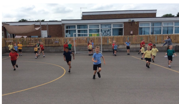
Year 1 were fantastic during Athletics this week!