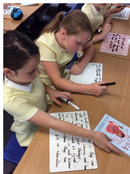
Year 4 worked hard planning for their debate in English this week.