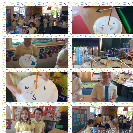
Year 2 enjoyed making their wind vanes and rain gauges as part of their Fieldwork Studies topic in Geography this