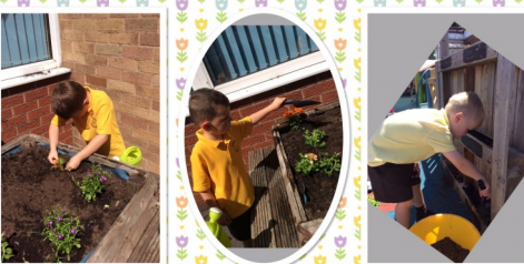
Reception have been watching their seeds grow and enjoyed planting some potted plants this week.