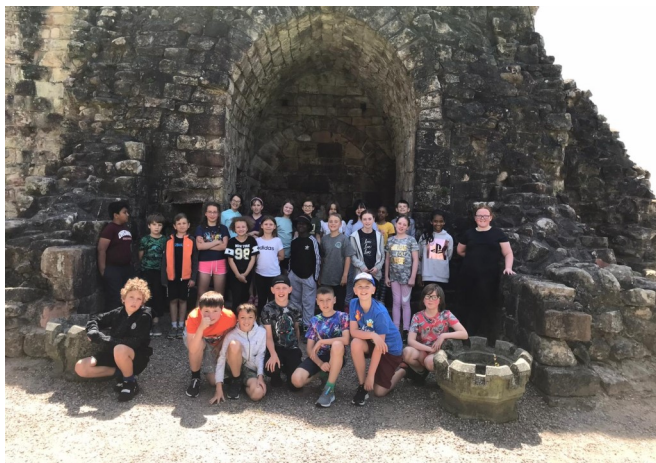
Year 5 had a great time on their residential trip to Alton Castle.