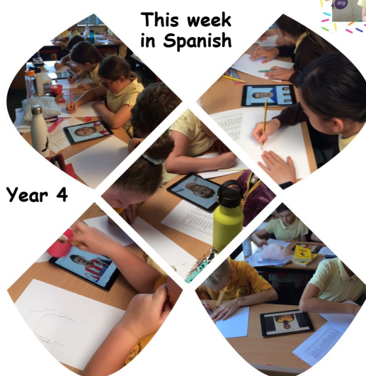
This week in Spanish